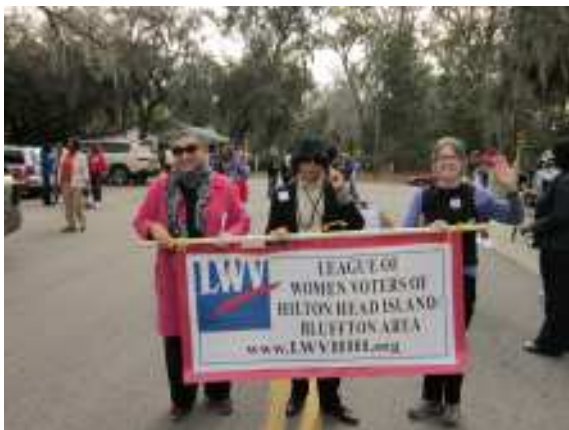
MLK Observance in Bluffton