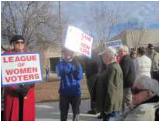
MLK observance in Hilton Head